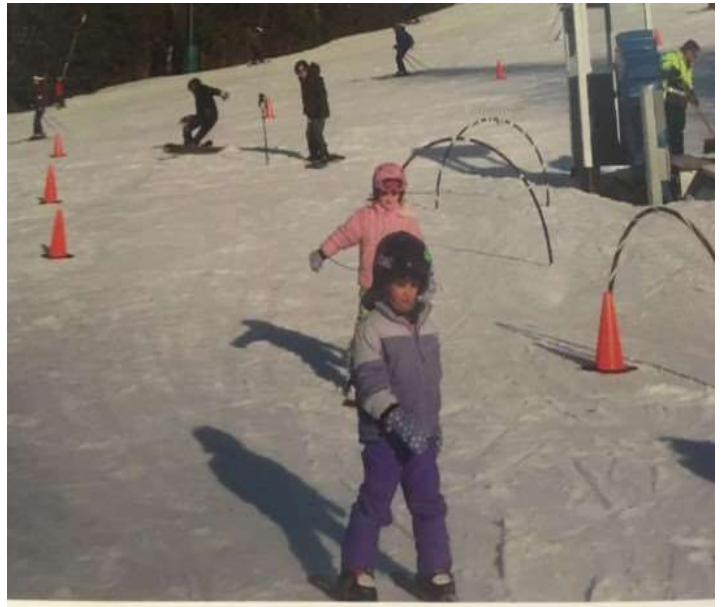
Nightlife at the ski tow!!!