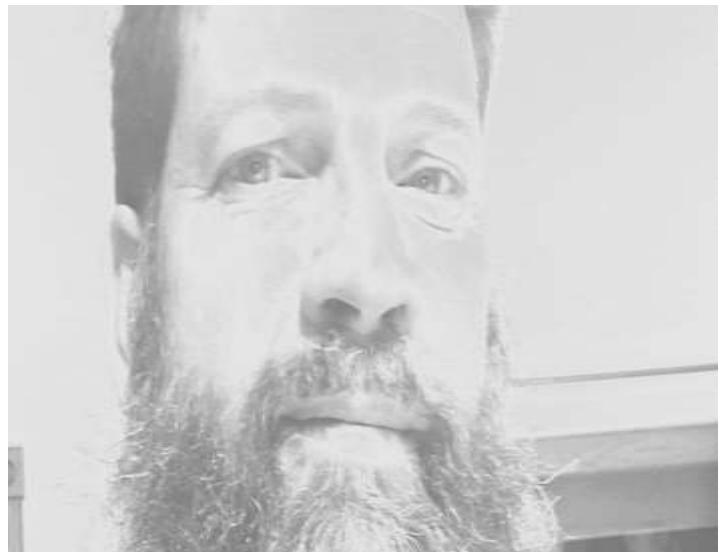
Barre Lions Club Fundraiser