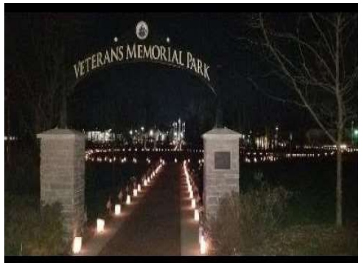
Connecticut Lions honoring their veterans!!!