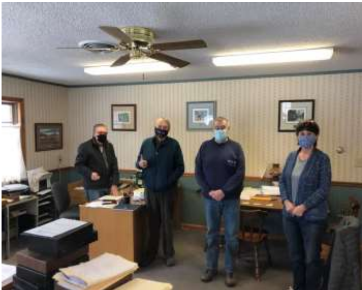
Castleton Lions Final Drawing

Congratulations to our raffle winners and thanks to all who continue to support our clubs efforts 🙏