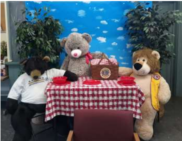
Massachusetts Lions on picnic at their mid-winter!!!

Colchester Connecticut Leos hosting a shoe and sneaker drive.