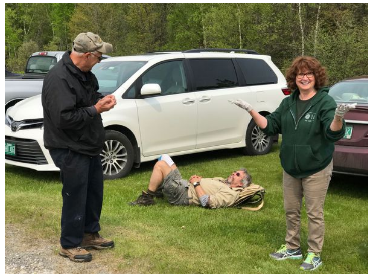
Must be they overworked him