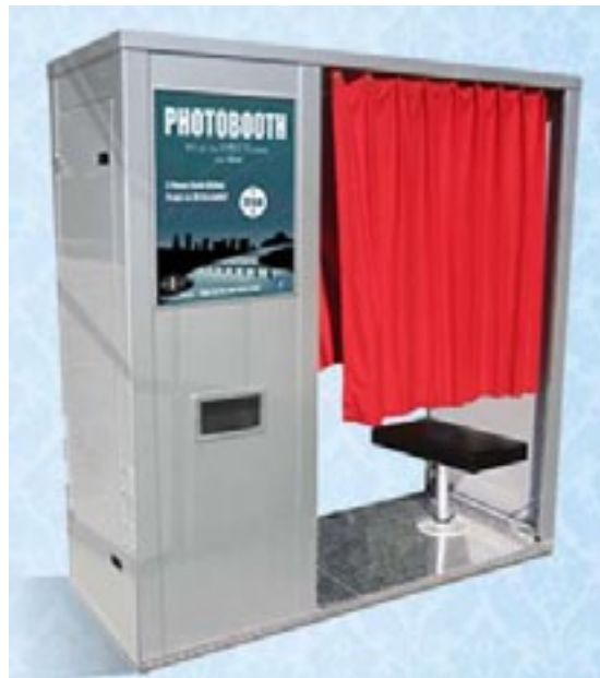
Photobooth provided by Photobooth Planet (PhotoboothPlanet.com)

WHO can have the most interesting photo taken???