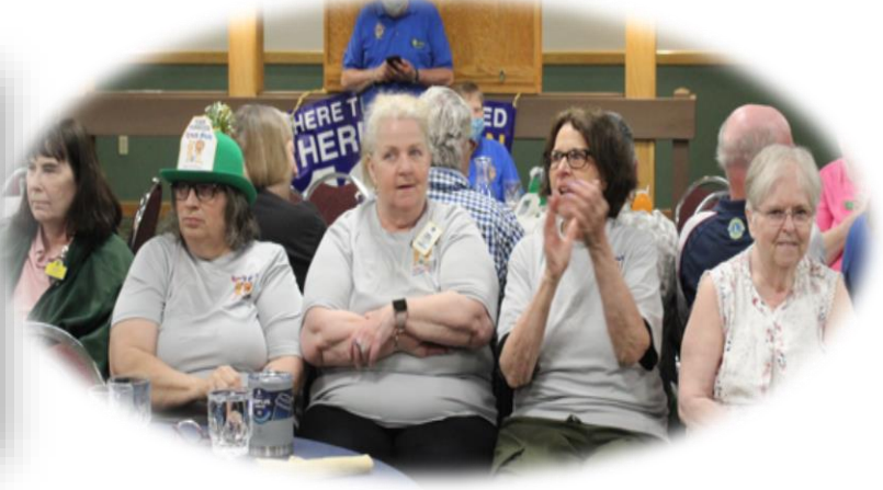
Musical Chairs .....