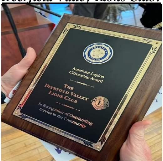
Good Citizenship Award from American Legion

Wilmington, Vermont – On Memorial Day, 2022, the Deerfield Valley Lions were honored with a Good Citizenship Award by the American Legion during an annual celebration in Wilmington. This recognition, typically reserved for an individual, was a surprise and the members were deeply touched by this recognition. Making the award even more special is the fact that it was shared with the Rotary of the Deerfield Valley.