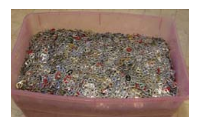
PULL – TAB UP DATE