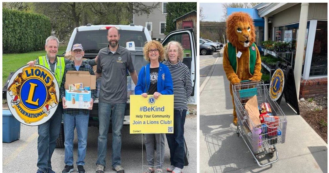
Our new Lions club collected 330 pounds of food & $200 in donations for the Shelburne (VT) Food Shelf, and had a great time volunteering together. Thanks to the Shelburne Market for welcoming us to their wonderful venue - and to the generous community. Next: Doing the same for South Burlington VT.