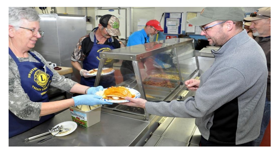
Londonderry Tri-Mountain Lions Club: