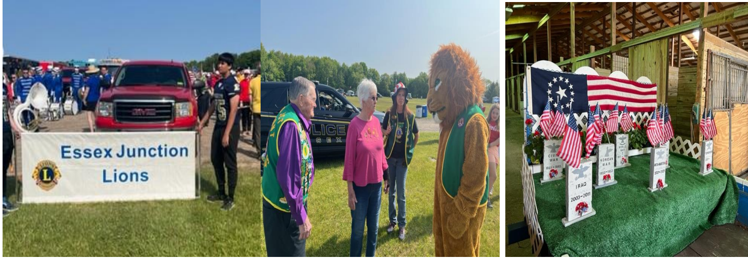
Few scenes from the 2023 Memorial Day parade.