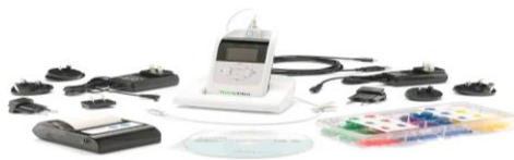
An OAE Hearing Screener