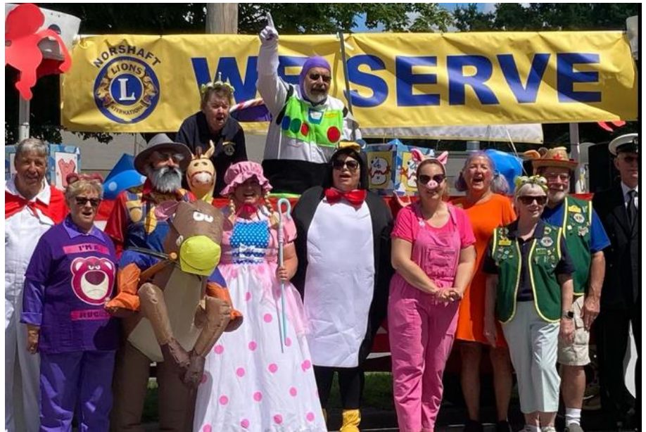
2023....Congratulations on the Best Service Club Float, 1 st Place!