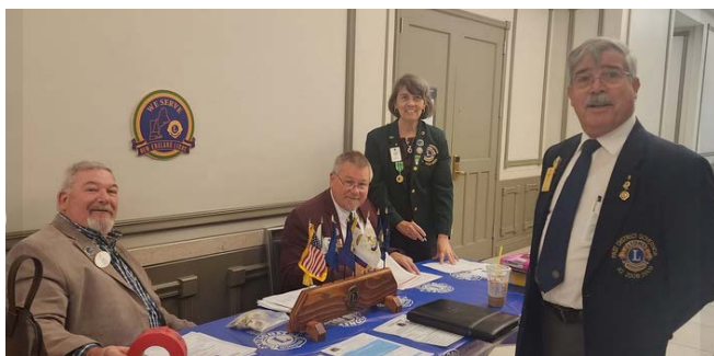
New England Governors' Reports and Necrology Service.

Immediately following lunch was the business meeting,