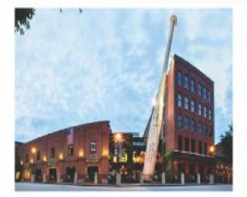
The Louisville Slugger Museum

Directors booth to have one-on-one conversations. Pick up additional courses towards your Lions University degrees. And speaking of the seminars, I just received an update to the seminars list from our education team and they are putting together an outstanding list of learning opportunities. There are also many other opportunities to take part in in Louisville. Perhaps you might like to take a trip to the Louisville Slugger Museum and pick up a personalized bat.