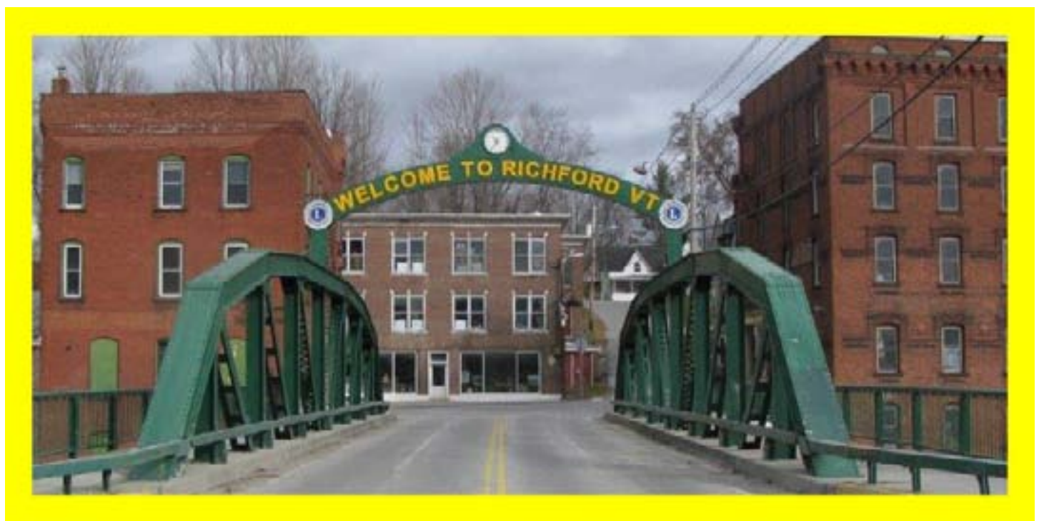
"Welcome To Richford" flanked by Lions!