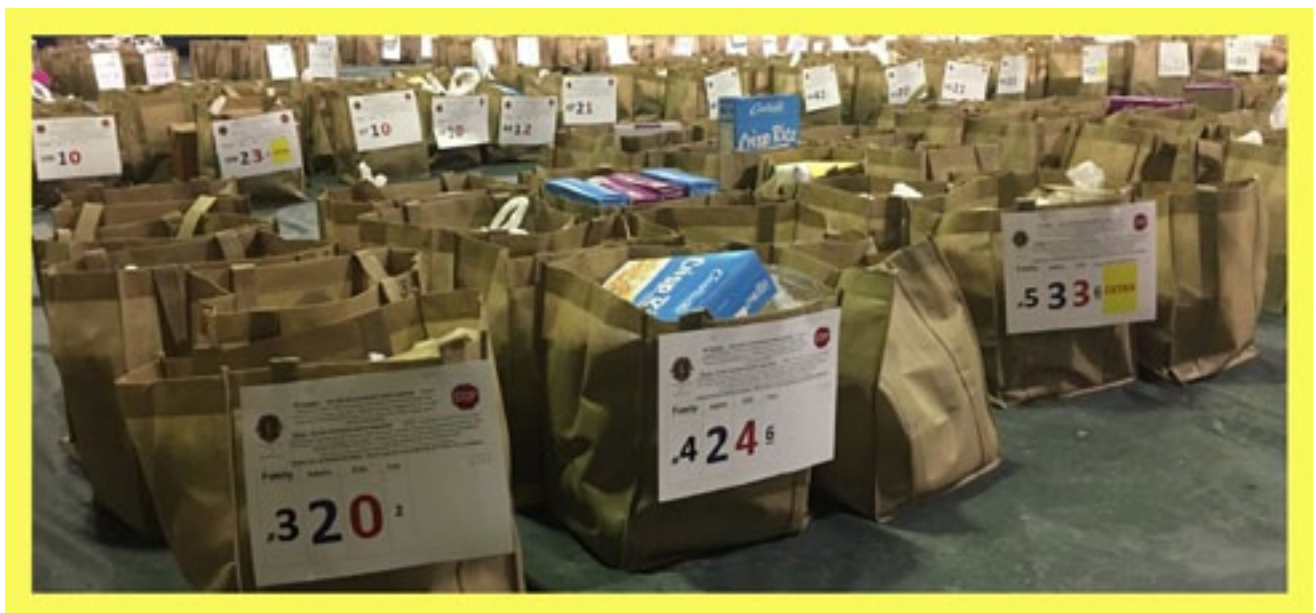
Bags upon bags of food staples and produce. Turkeys, fresh chicken, and Cornish hens are given, too.