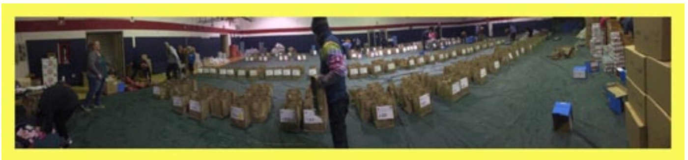
Panorama of the gym, with empty bags on the floor mats, surrounded by pallets of food from the Vermont Food Bank.

Visit and “Like” the Whitingham-Halifax Lions, as well as the Hungry Lion Bike Tour, on FaceBook – and learn about the Holiday joy being spread in the Deerfield Valley.