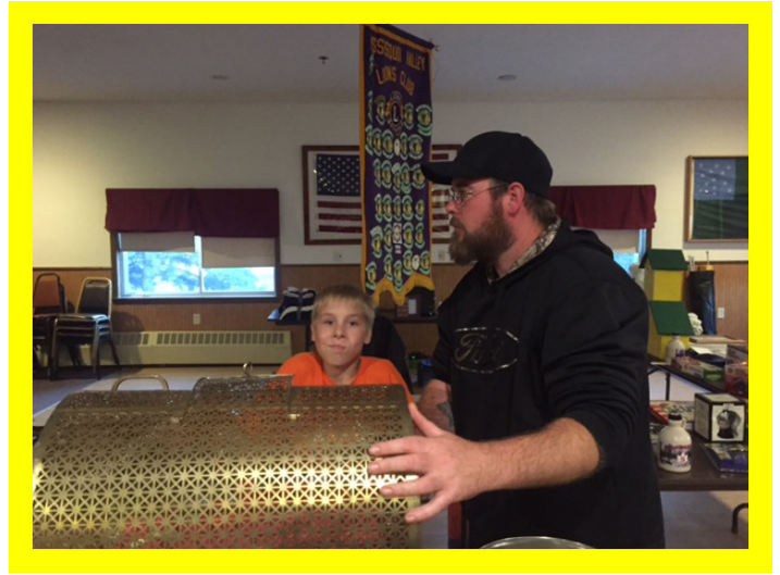
Round Robin Rib Raffle Fundraiser