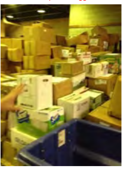
The New Jersey Lions Eyeglass Recycling Center (NJLERC) is a 501 (c)3 all volunteer organization that provides recycled eyeglasses to Lions and other mission groups who perform vision screening and/or eye examinations in developing countries and the United States.

The NJ LERC distributes 50,000 to 100,000 glasses annually.