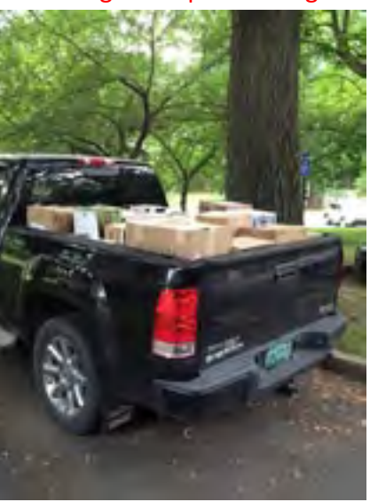
The LERC pile is bigger....