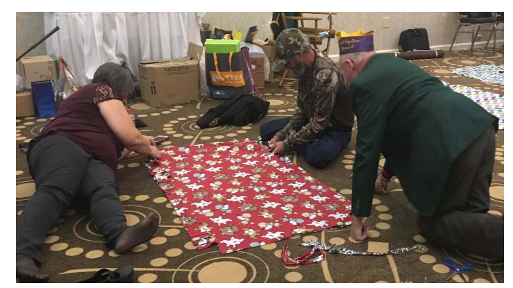
Members working on blankets together!

\label{eq:Break Out Sessions - Service Project - Speakers - Cabinet Meeting = FUN} Break Out Sessions - Service Project - Speakers - Cabinet Meeting = FUN