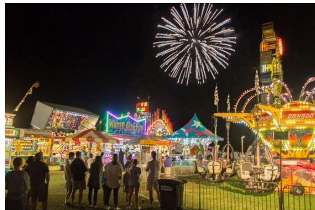
A nice night at the Norwich Fair

If you are interested in buying one please see any Norwich Lions Club member that you may know or come and see me and I can sell you one. You can make a check out to the Norwich Lion's Club or pay cash (sorry no credit cards). If you need one you can call me at 802-829-9133 and leave a message.