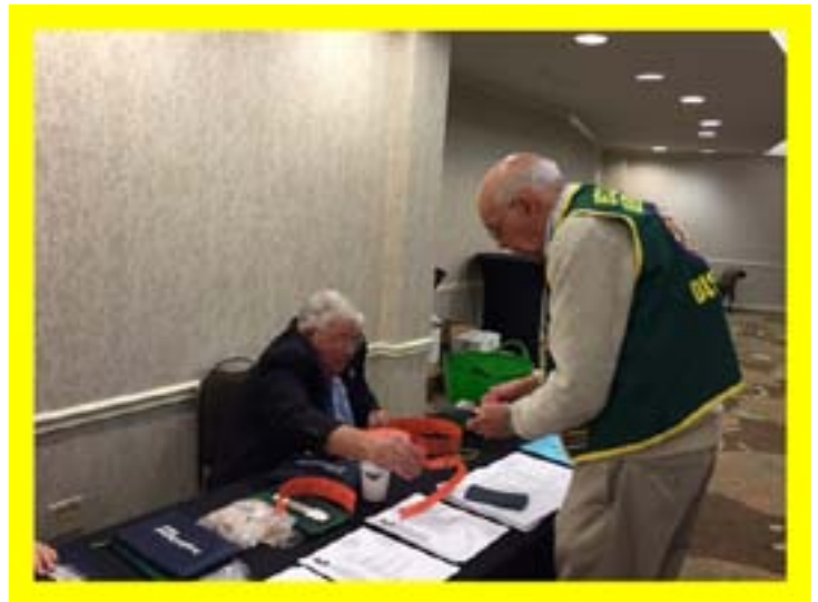
Cabinet Meeting Ticket Sales Going Strong!