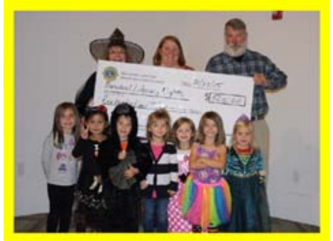
Manchester Lions Club Awards a grant to the Manchester Community Library to support Preschool Family Literacy Nights