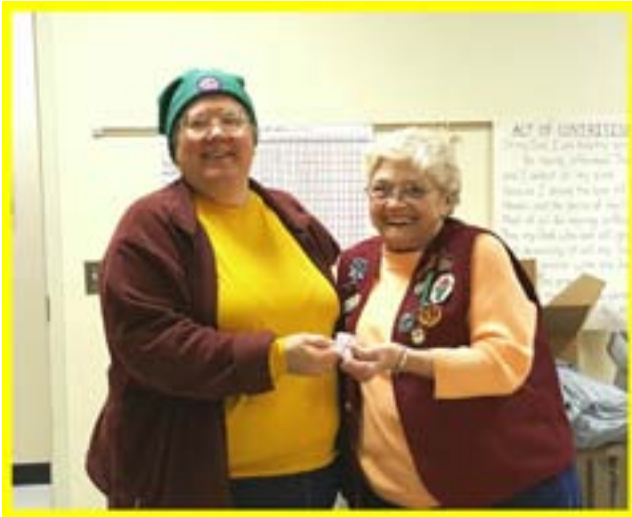
Zone Chair Visits Williston!