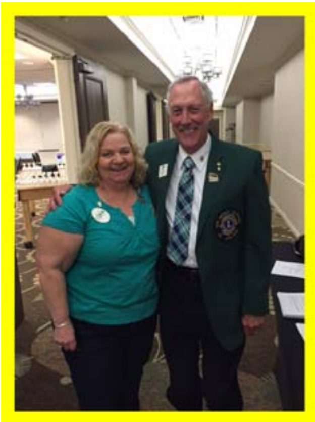
Cabinet Meeting Smiles!