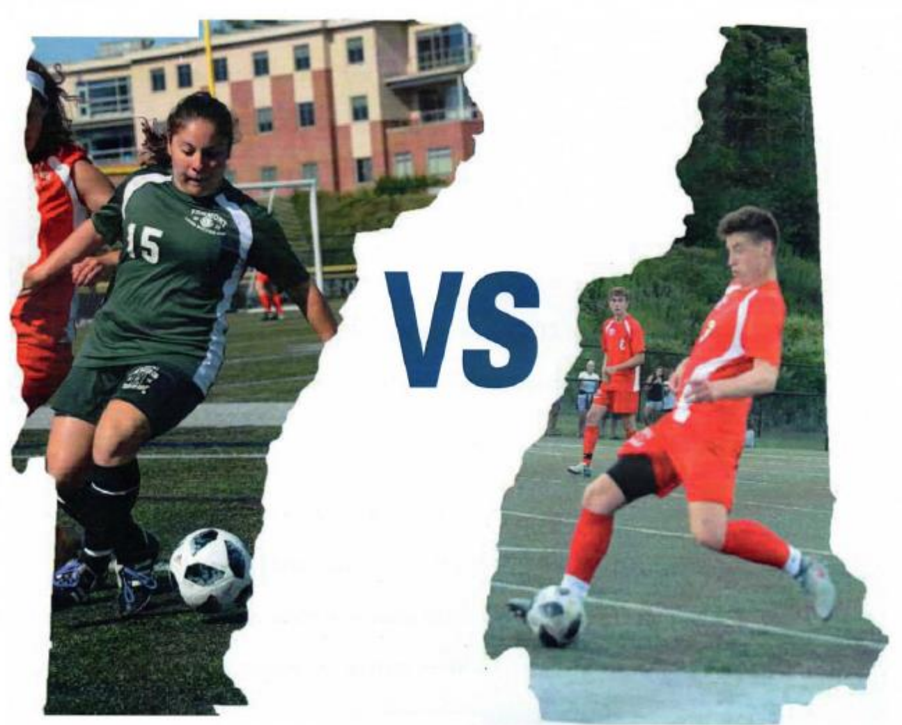
All proceeds to NH & VT LIONS Charities NH Lions Sight and Hearing Foundation & Green Mountain Lions Camp