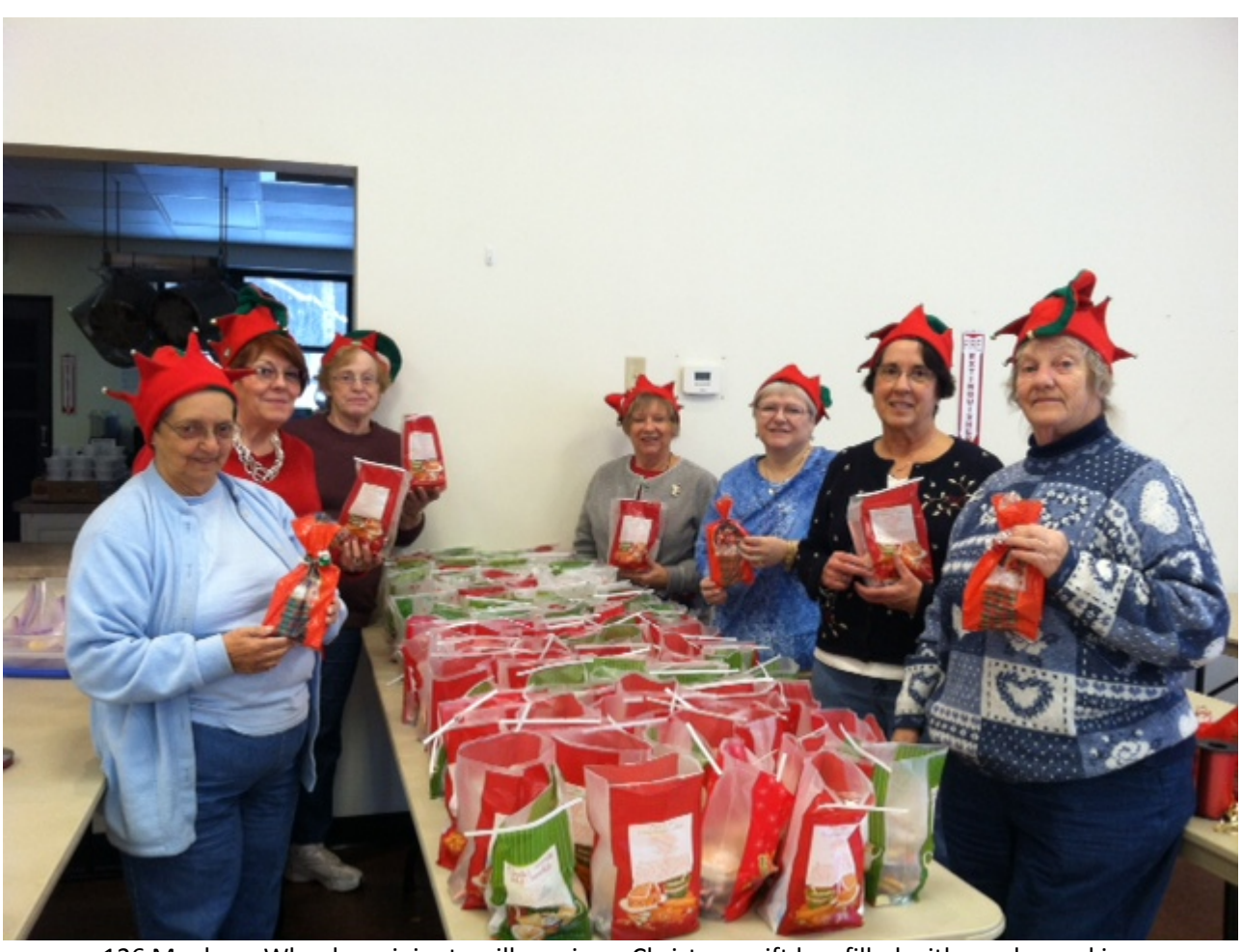
126 Meals on Wheels recipients will receive a Christmas gift bag filled with candy, cookies, and gift items filled by Santa's helpers the Colchester and Essex Jct. Lions and friends.