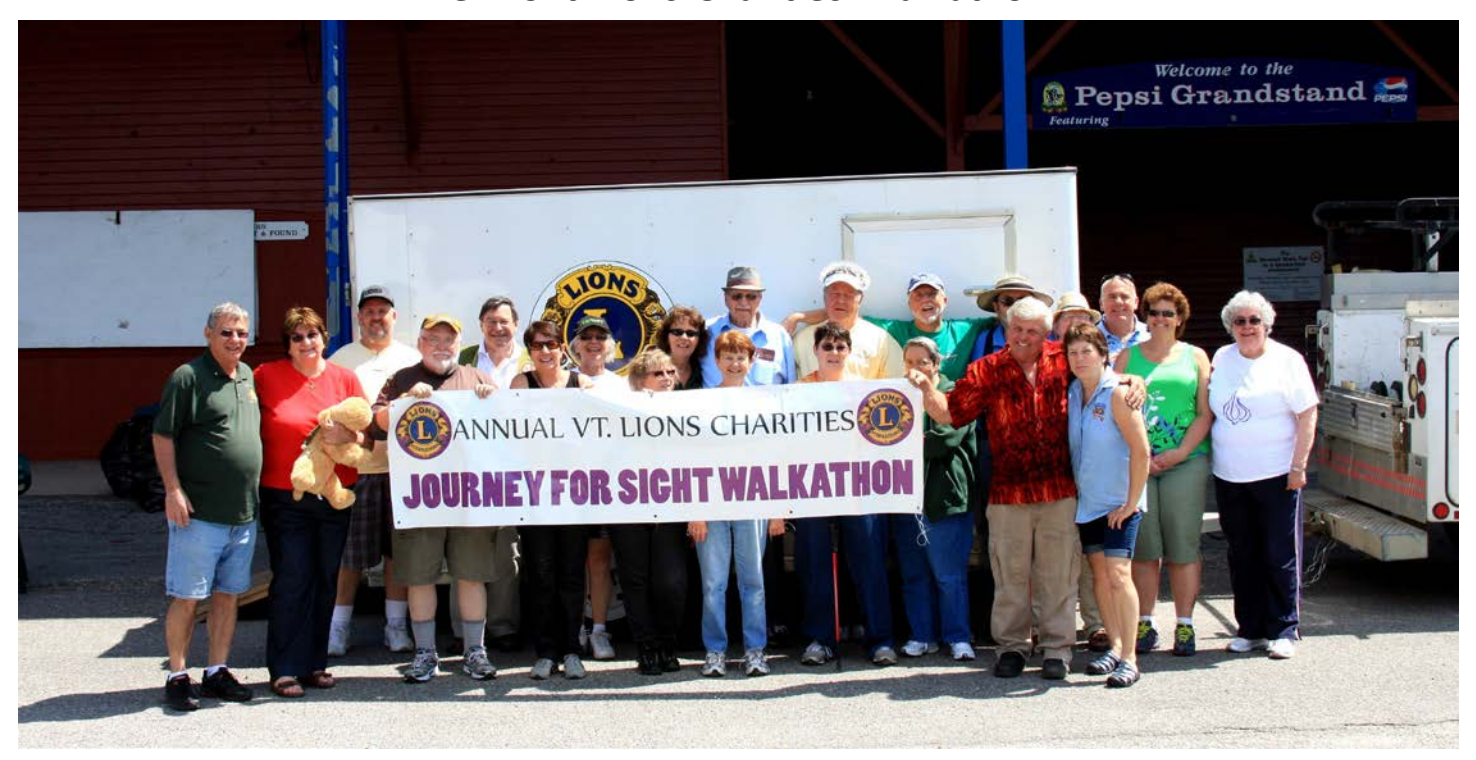
Fellow Vermont Lions,

The sixth edition of the Vermont Lions Charities Walkathon has come and gone. On a wonderful May Saturday morning/afternoon, over 80 Vermont Lions and friends (including 4 legged) came together at the Vermont State Fairgrounds in Rutland to raise funds for Vermont Lions Charities and other designees.