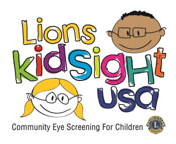
District 45 Vision Screener Schedule and Availability