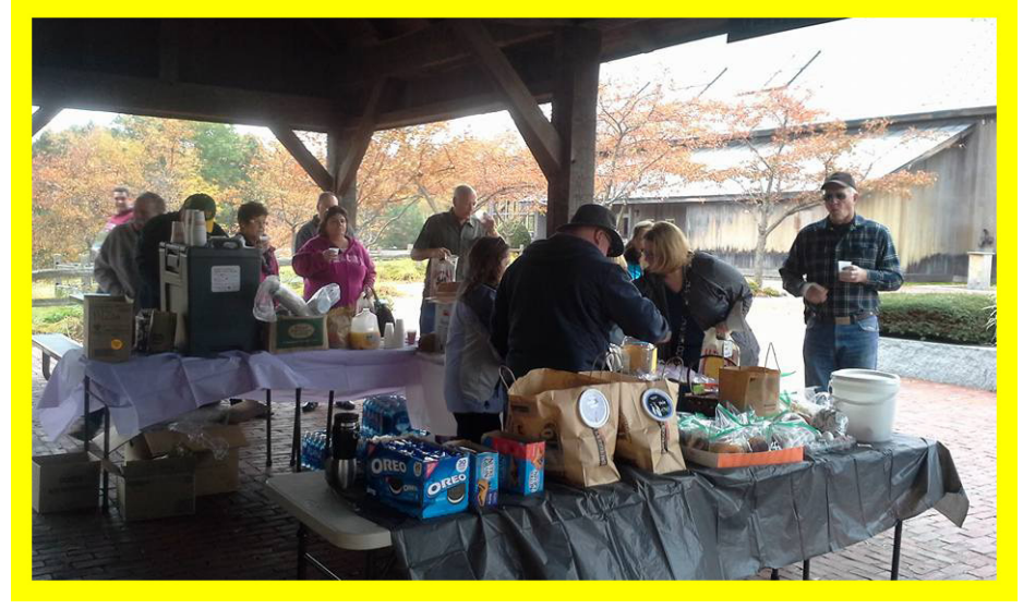
October 16, 2016 3rd Annual BALC Coffee Break