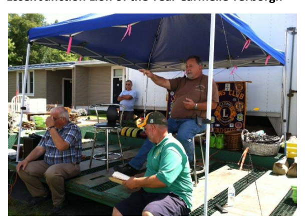
Colchester Lions Auction