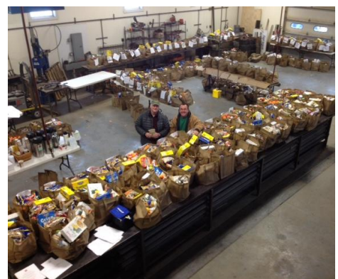
Friday night before Christmas. Packed up and ready to deliver tons of nutritious / long-lasting food staples