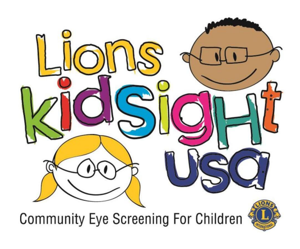
District 45 Vision Screener Schedule and Availability