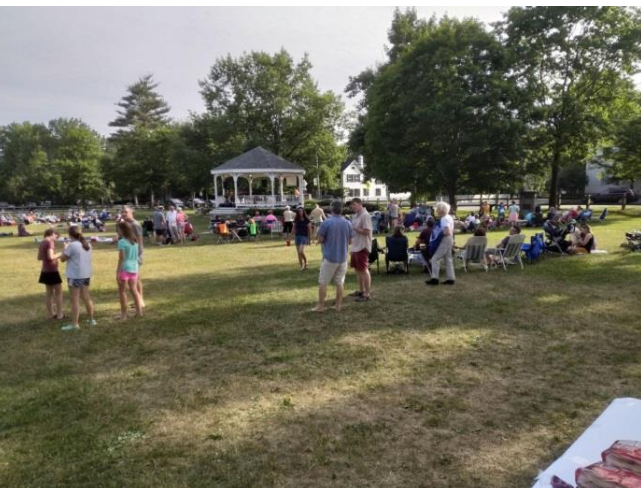
The crowd makes their way to the bandstand