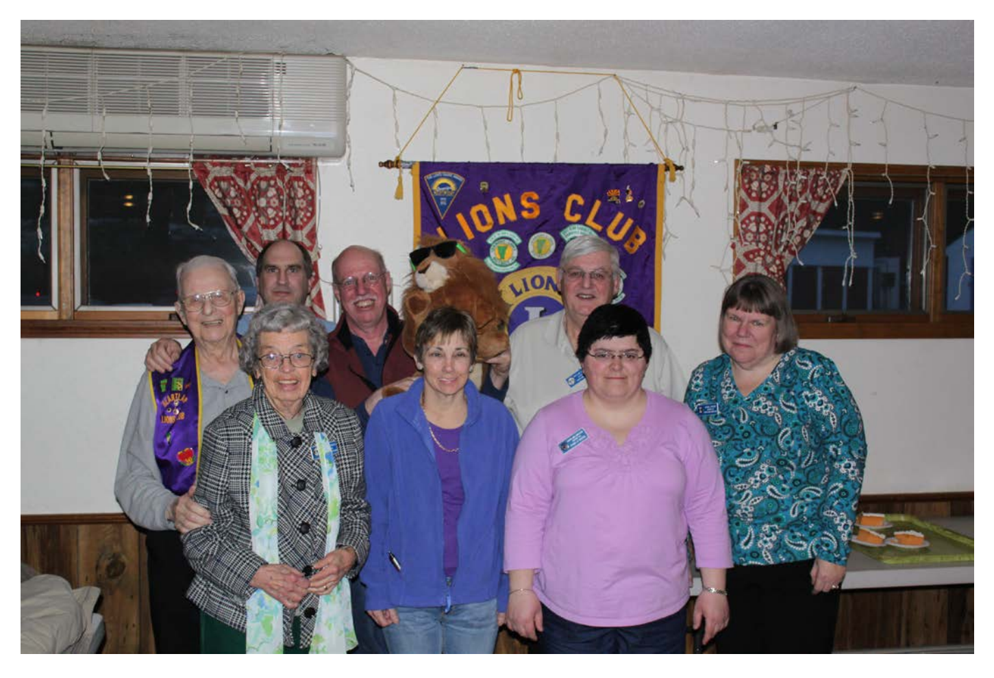
Lions Storm Springfield

On April Fool's Day, thirteen Heartland and Strafford Lions descended upon the Springfield Club to capture Region 3 Lion Chucky. Heartland, by sheer numbers, was able to re-capture Chucky and return him to their home. Chucky seems to enjoy the lifestyle offered to him there, having become quite the party animal. He remains a fun ambassador for Region 3, bringing together Lions for fun and fellowship.